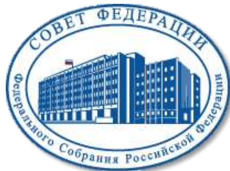
Federation Council, Federal Assembly Russian Federation