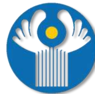
Executive Committee of the CIS